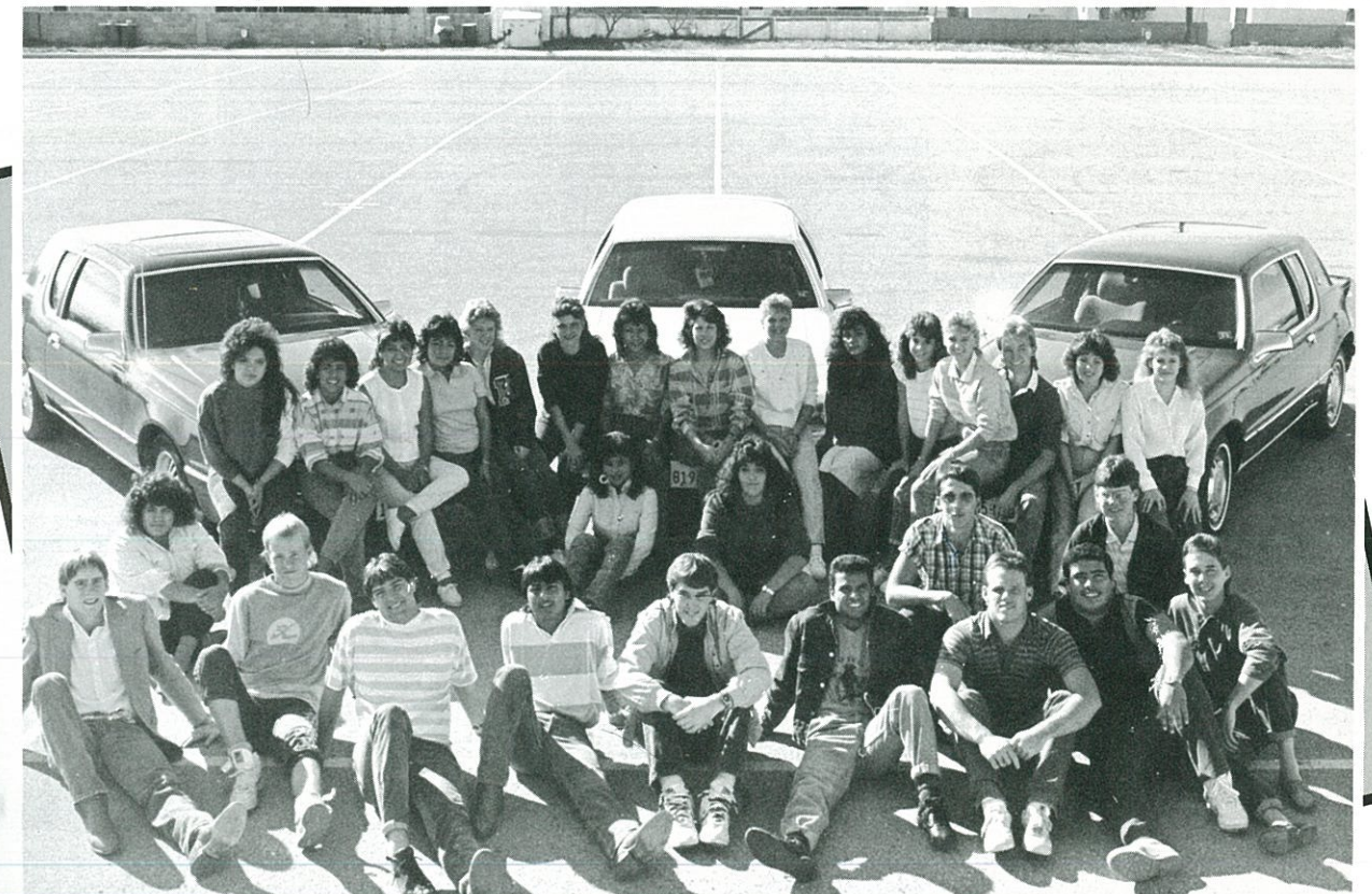
Ladies and gentlemen . . . Seniors of 1988.